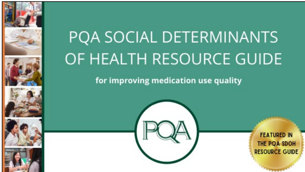
Social Determinants of Health (SDOH) Resource Guide Cover Image: